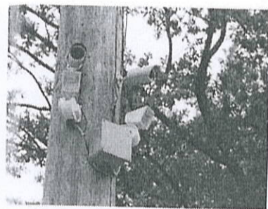
Cameras and motion sensors like these can be placed around a construction site to detect intruders.

The technology solves several problems. Other video cameras may record the crime, but often police are unable to